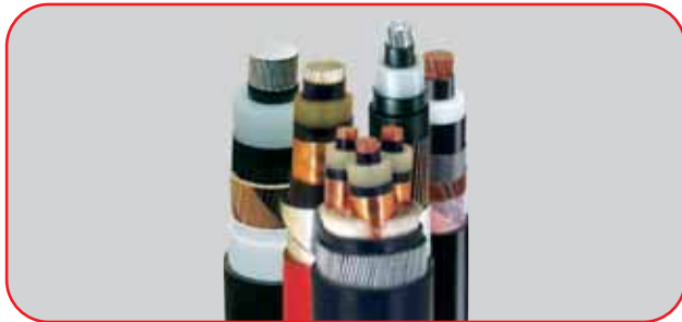
HIGH VOLTAGE CABLES