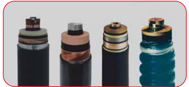
EXTRA HIGH VOLTAGE CABLES