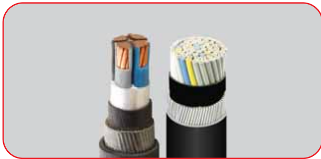
LOW VOLTAGE CABLES

Ravin is involved in the manufacture of technology-driven energy cables. We offer a complete range of cabling solutions for LV, MV, HV, EHV cables from 1.1 kV to 220 kV from state-of-the-art manufacturing units in India and U.A.E. Ravin also provides allied services like Cable Jointing, Cable Laying and other specialised services.