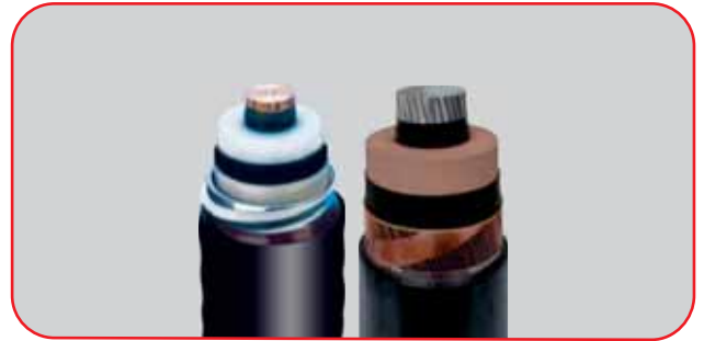
MEDIUM VOLTAGE CABLES