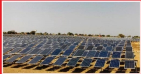
UNIPOLAR TILTED TRACKING SYSTEM