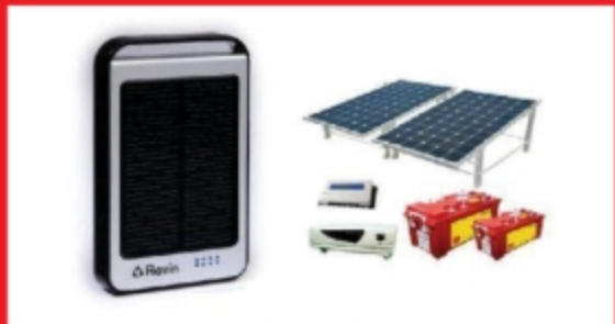
SOLAR CHARGERS & HOME LIGHTING SYSTEMS