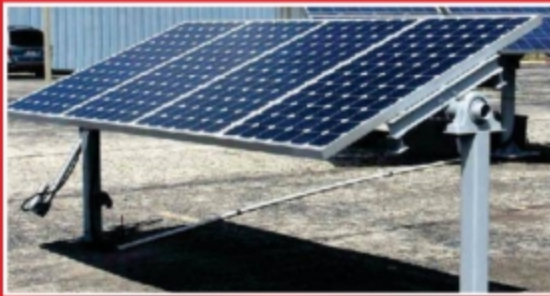
SINGLE AXIS TRACKER