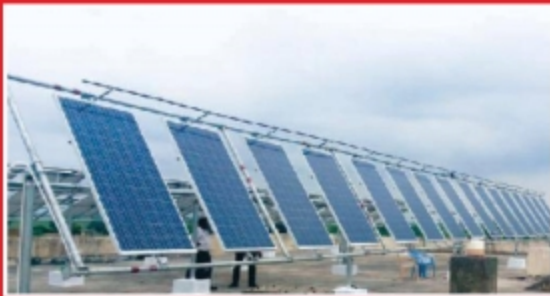
FIXED ARRAY TRACKER