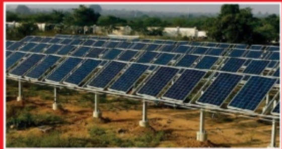
DUAL AXIS TRACKER